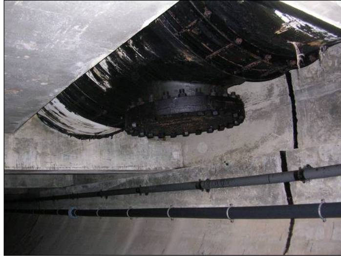
Figure 6. Blank flange at outlet pipe soffit

achieve the desired drawdown performance, and so this was not considered further.