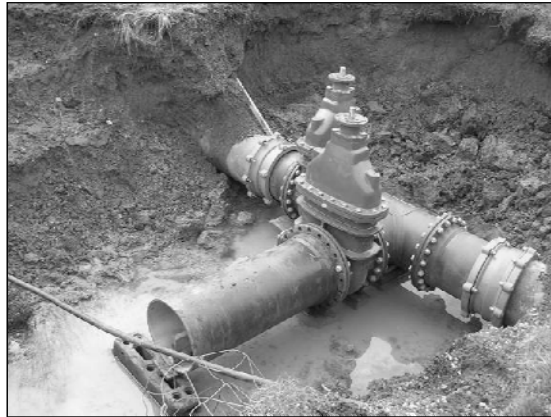
Figure 1. A 450mm tee installed at reservoir outlet pipework, Foxcote Reservoir

With the reservoir out of service, there are no implications associated with the works in regard to interruption of supply. The preferred solution for increasing drawdown capacity to 50% volume reduction in 10 days was to modify the outlet pipe by installing a 450mm tee into the existing disused outlet pipework so that releases can be made into the spillway stilling basin (Figure 1). The work was completed in 2010.