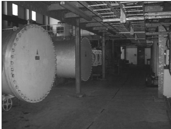
Figure 9. Blank flanges at Empingham pumping station

This option has the advantage that much of the pipework is already in place minimising cost and disruption. The disadvantage of this option is the potential effect on the River Gwash and infrastructure in its downstream catchment. Therefore a variation on this option has been considered allowing the drawdown flow to fill the shaft and reverse flow down the tunnel to Tinwell intake pump station at the much larger River Welland.