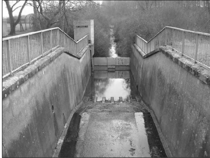
Figure 7. Fine screen at discharge channel to prevent the release of any invasive shrimp

downstream environment (Figure 7), as could be the case with either of the above options. The shrimp does not affect potable water quality.