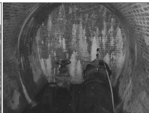
Figure 5. 300mm scour valve at concrete bulkhead, Pitsford Reservoir