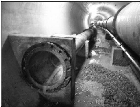
Figure 2. Existing 300mm scour pipe, Alton Water

Although the preferred option can only achieve 50% volume reduction in 12 days, the Inspecting Engineer agreed that this could be considered as the preferred option providing other measures, such as an increased surveillance regime, are in place to reduce the risk of an incident. It was also noted that in an extreme event temporary measures such as mobile pumps could also be deployed.