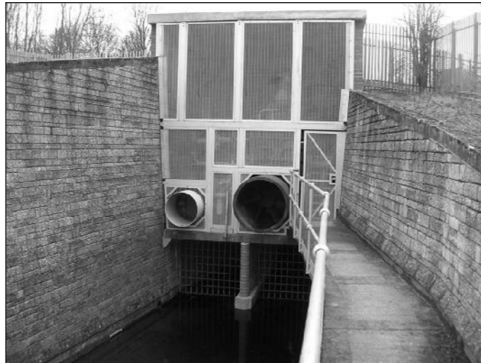
Figure 8. Washouts from the two supply pipes, original on the right, new on the left, discharging to the tailbay

Calculations were made in the 2005 study before the new 800mm supply pipe was installed. Two scenarios were considered – one with supply maintained to the treatment works and the other with the supply shut down and scour releases made from the supply main.