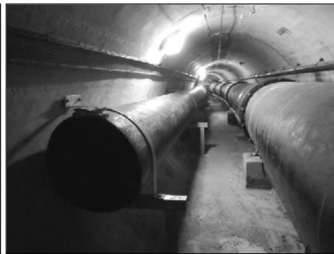
Figure 3. Enlarged 600mm scour pipe, Alton Water

Downstream of the stilling basin the receiving watercourse passes under a B road and through a disused mill. This area had previously been improved to cope with the previous drawdown rate. It is not anticipated that further improvement will be planned as drawdown would be done initially at a rate that does not cause flooding, increasing the rate only if the situation worsens.